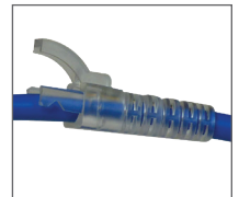
Boot for UTP Snap Plug