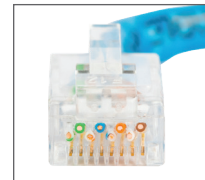
Cat6a UTP Snap Plug